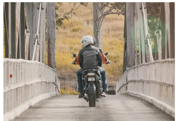
Snippet from the ‘Roads We Ride - Oxley Highway’ video